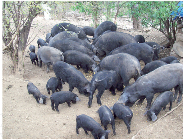
Figure 2. Moravka sows with piglets.