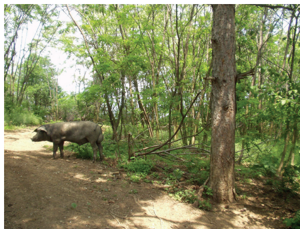
Figure 3. Moravka boar.