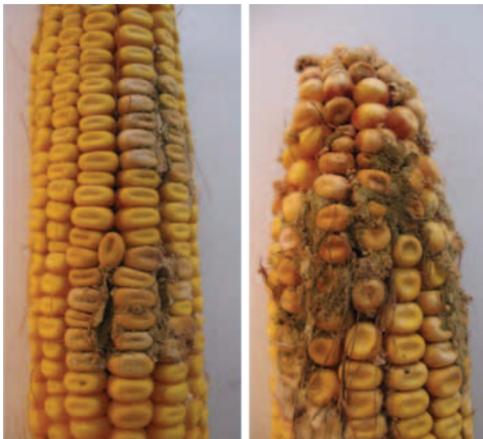
Figure 1. Olive-green powdery mould ( Aspergillus flavus ) on maize ears injured by ECB ( Ostrinia nubilalis )

Precipitation factors as indicators of climate conditions in the study period show that conditions were arid and semi-arid during 4–5 and 1–2 out of 6 months, respectively, in the growing seasons of 2008–2012 (Table 1). Exceptionally, climate conditions in June 2009 and May 2012 were semi-humid.