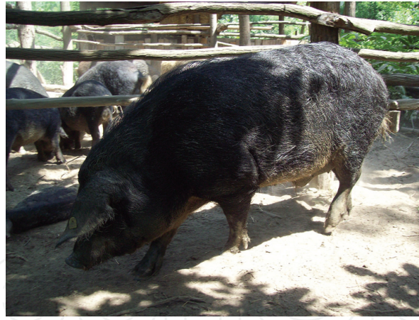
Figure 3. Mangalitsa boar.